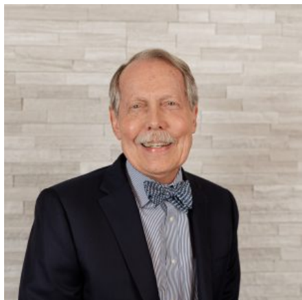
Gordon D. Gee Senior Counsel